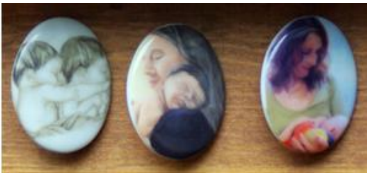
Bond of Twins