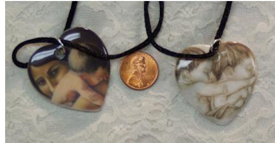
Compared to a Penny