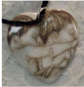
Bond of Twins